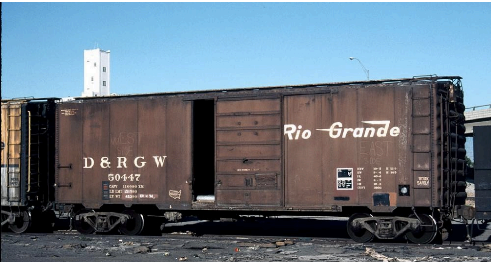
DRGW 50447, Photo June 1982 in Salt Lake City, UT