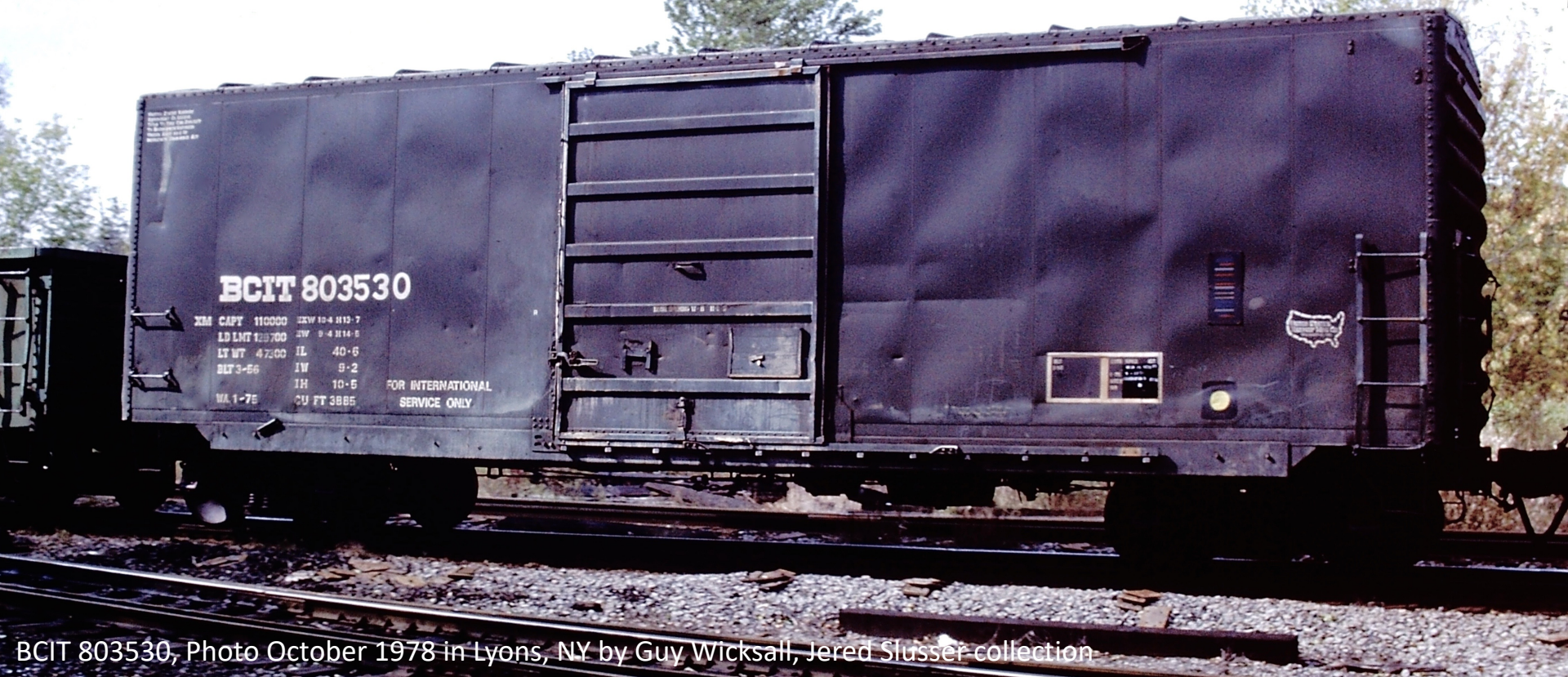
BCIT 803530, Photo October 1978 in Lyons, NY by Guy Wicksall, Jered Slusser collection