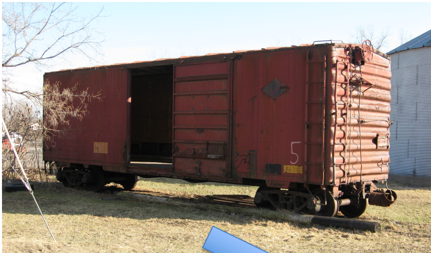
LV 62638, Manchester, NY, September 2013