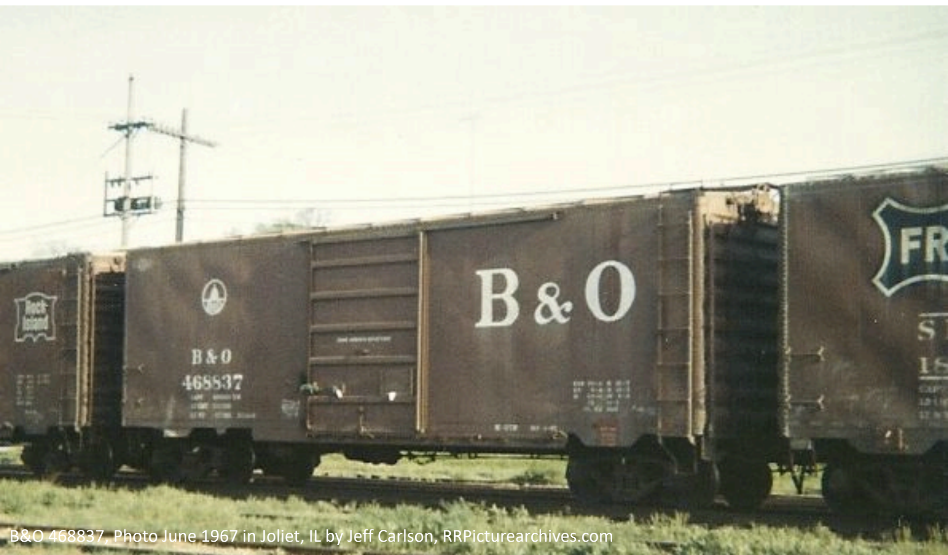
B&O 468837