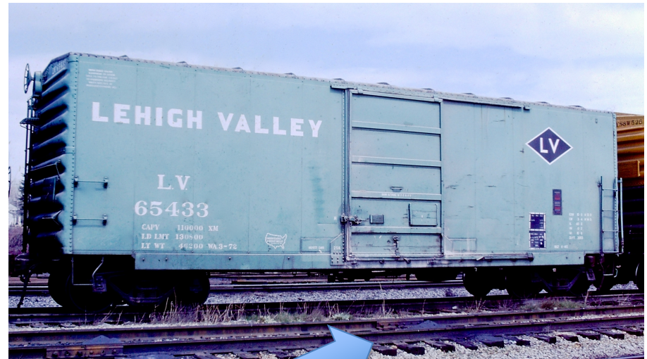
LV 65433, Geneva, NY, May 1978, Photo by Guy Wicksall