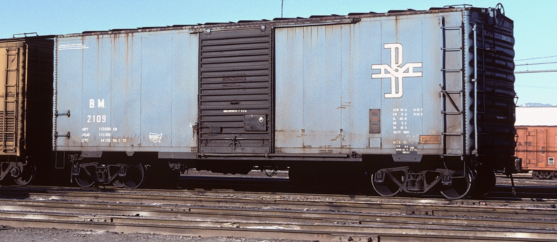
BM 2109