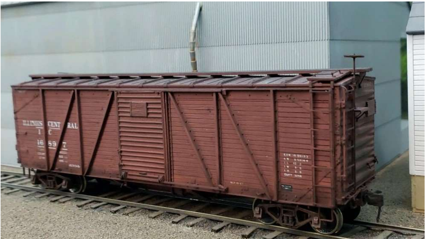
Model by Ed Rethwisch